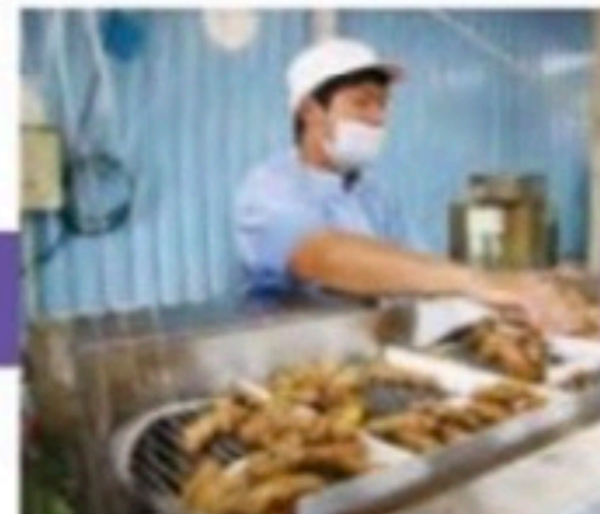
The Ukon is lifted on a conveyer belt where soil and any other impurities are sprayed off.