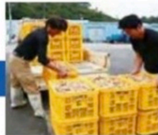
Local farmers harvest Ukon roots in the field and transports them to the factory in crates.