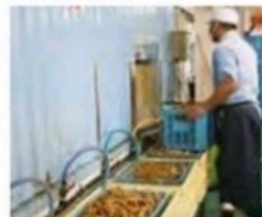
The crates of Ukon are soaked and sanitized in larger containers of running Strong Acidic (pH2.5) Water for 2-5 mins.