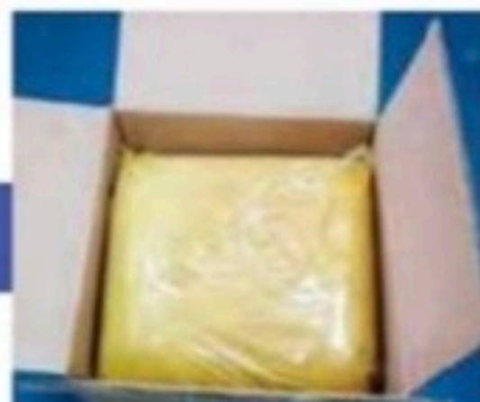
The Ukon is coarsely ground into powdery form by a fine grinder.

The Turmeric Factory has been registered as a food facility by the U.S. Food and Drug Administration.