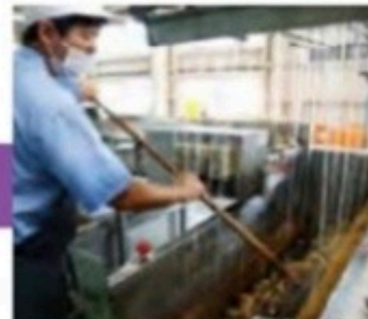
The Ukon is lightly scrubbed and peeled under a shower.