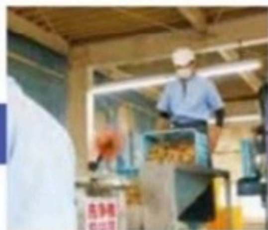
Harvested Ukon (turmeric) is pre-washed in Strong Kangen (pH11.0) Water.