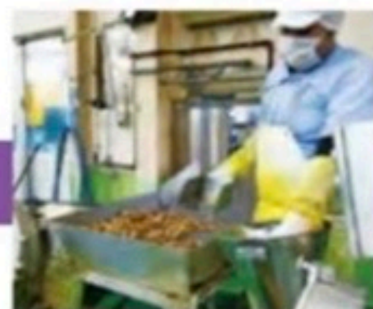
The Ukon is washed through a hot shower and slice it to the thickness of one millimeter and spread to a tray.