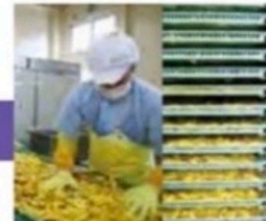
The Ukon trays are slid into a heat-dryer for about 7hours in 72°C . (161.6 F°)